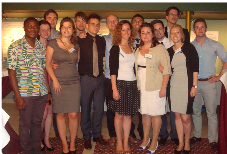
Group of EXACT Fellows, Final Conference, Brussels, 10 - 12 July

Learning the lessons from EXACT and spreading its positive experiences for the benefit of future transnational PhD programmes in EU studies stood at the forefront of the second part of the final conference: a roundtable on "The Future of EU PhD studies". It drew together the expertise of the EXACT and INCOOP consortiums as well as that of the PEGASUS project. Panelists agreed on the added-value of a truly